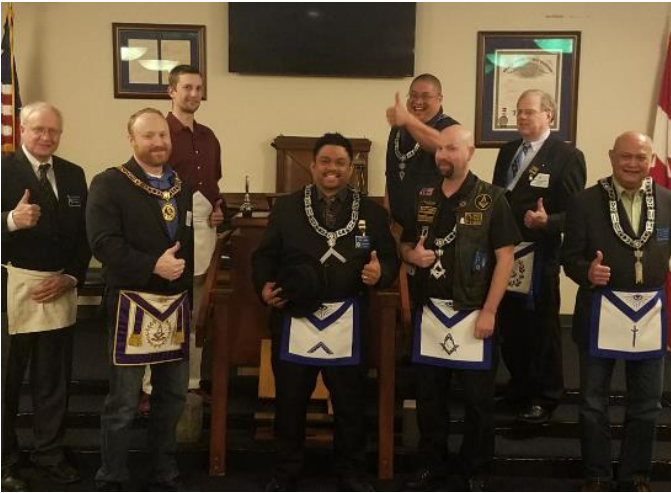
Brothers of West Gate #128

The conversation explored the Spiritual Framework of Human Character we all work to evolve within ourselves.