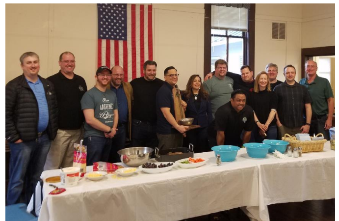
2017 Chili Cookoff Entrants, beholding how good and pleasant it is.

Helen Keller said "walking with a friend in the dark is better than walking alone in the light." For me, I am grateful that I get to walk in the light with my brothers, their families and friends.