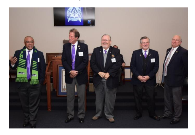
The Grand Lodge Officers during the Q&A Session

by the Masters (or his delegate) from each D7 Lodge as well as brief remarks by all members of the Grand Line.